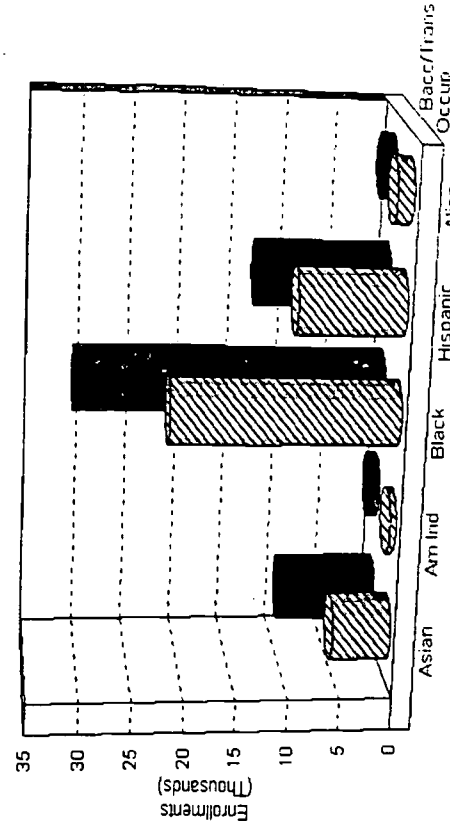
Fig. 1. Fiscal Year 1997 Minority Enrollments in Baccalaureate/Transfer and Occupational Programs

Instructional Program Enrollments by Racial/Ethnic Origin. Figure 1 illustrates the distribution of minorities in the two largest program areas, baccalaureate/transfer and occupational/career. An examination